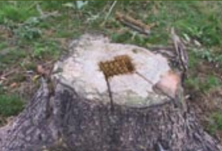
cut into the tree stump with the power saw