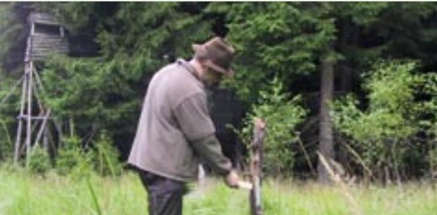
coat salt stick thinly